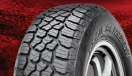
TRAIL CLIMBER AT