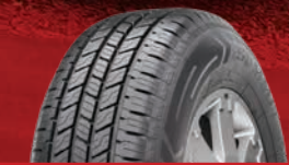
TRAIL CLIMBER HT II