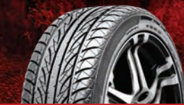
ULTRAMAX HP A/S