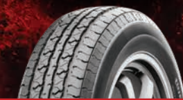
HI ROAD ST