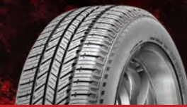
TRAIL CLIMBER SUV